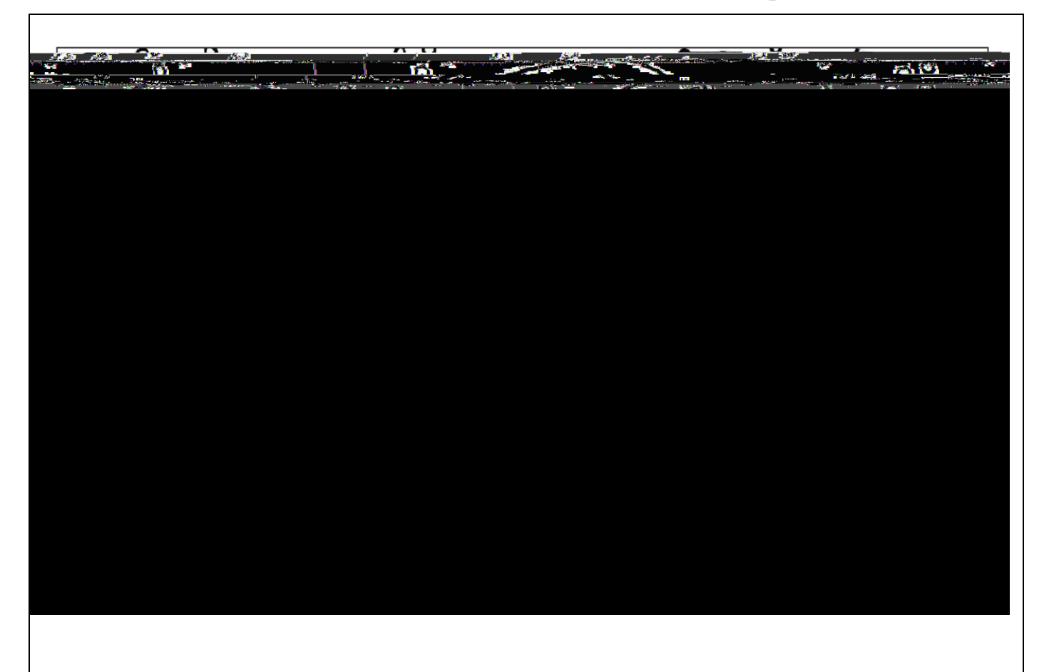
Illustration by lambsongs.co.nz via freebibleimages.com